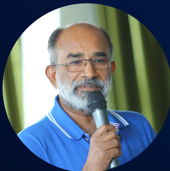
Alphonse Kannanthanam Former Minister of State