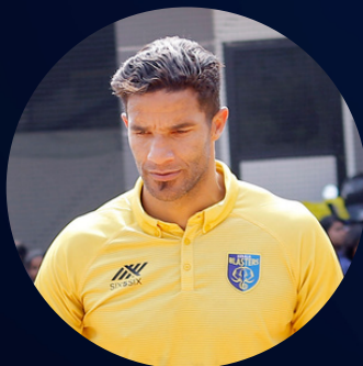
David James Professional Footballer