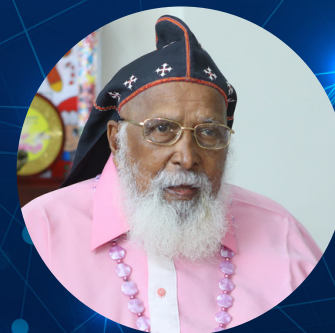
Philipose Mar Chrysostom Indian Prelate

Eminent speakers and guests from a variety of fields are invited to the school to engage with students to offer a diverse range of perspectives and expertise. These interactions include lectures, workshops, panel discussions and even hands-on activities which provides students with real-world insights, inspires them and helps them connect what they learn in the classroom to practical applications. Such interactions can also broaden their horizons and encourage them to pursue their passions and goals.