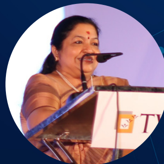
K S Chithra Playback Singer